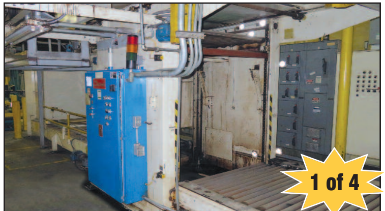
Currie LSP-5 Case Palletizers

Join our mailing list, email us at main@tauberaronsinc.com