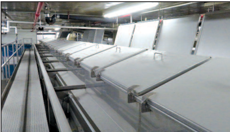
Shoulder Bros. 6'x60' 'Accumaveyor' Surge Bin