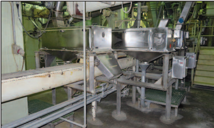
Pre-Sweetened Cereal Line