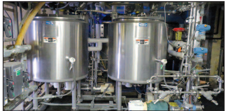
Walker Mix Jacketed Mixing Station

MPC Pre-Sweet Hot Water Supply System; Live Floor Surge Bins, Auger Feed; Live Floor Surge Bin w/Serpentine Belt Feed; Tempering Surge Bin; Safeline Mod. 400303, S.S. Conveyor Mount Metal Detector, 7" x 27" Aperture. S/N 12668; (2) Buhler-Miag Roller Mills; (2) 10hp Motors; (4) 30" x 45' & 20' & 12' S.S. Frame Trough Conveyor, from MPC Dryer; (5) S.S. Shaker Conveyors, 24" x 140", 24" x 107", 24" x 20', 29" x 8'; Steam Injection Hot Water System