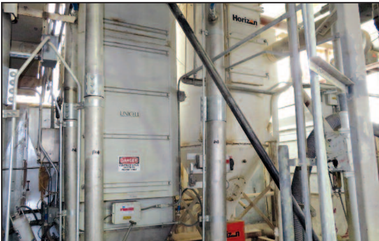
Unicell Dust Collector