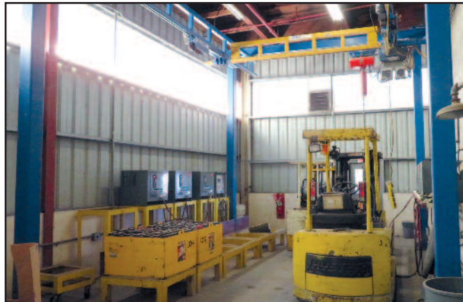
Gorbel Battery Hoist System