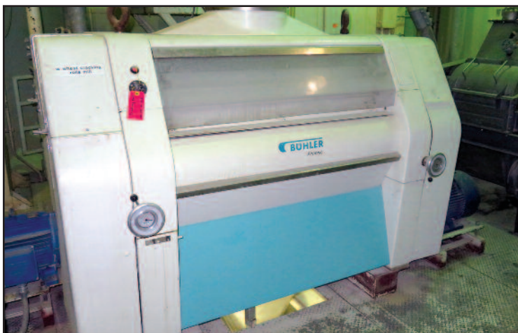
Buhler Wheat Scourer