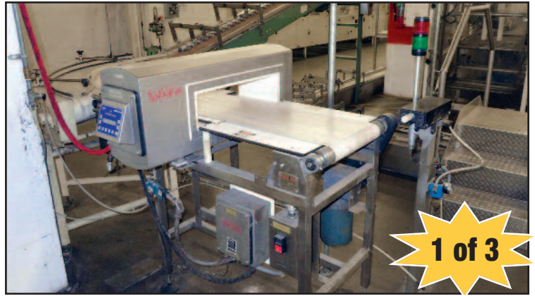
Safeline 6"x16' Metal Detectors