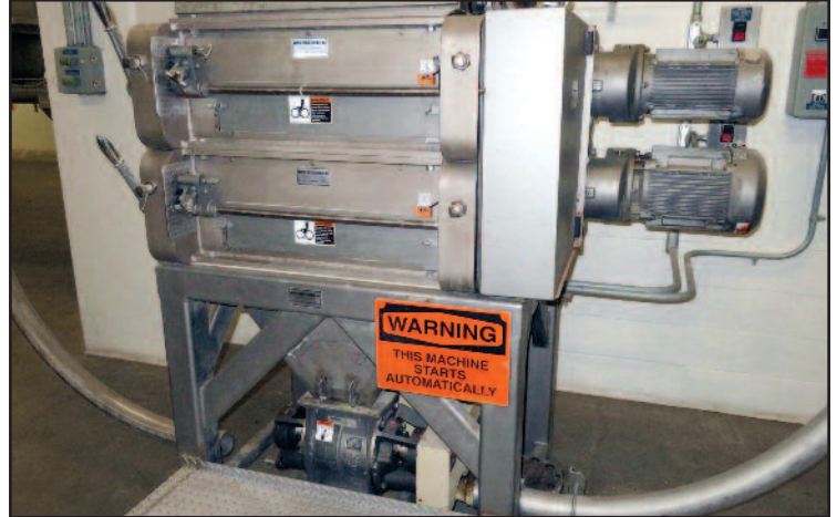
Modern 2-Roll Tack Grinder