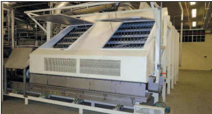
Finished Feed Bin