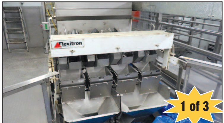
Ishida Flexitron 21-4 Head Weigh Scale Feeders

Former Assets of Post Foods Cereal Manufacturing