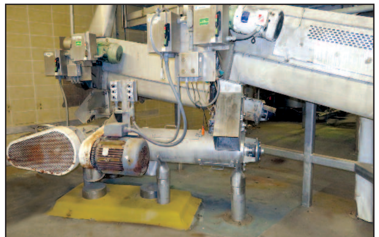
Dual Paddle Conveyor - Blender