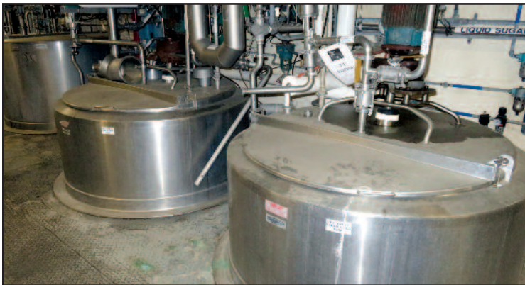
Syrup Mixing System