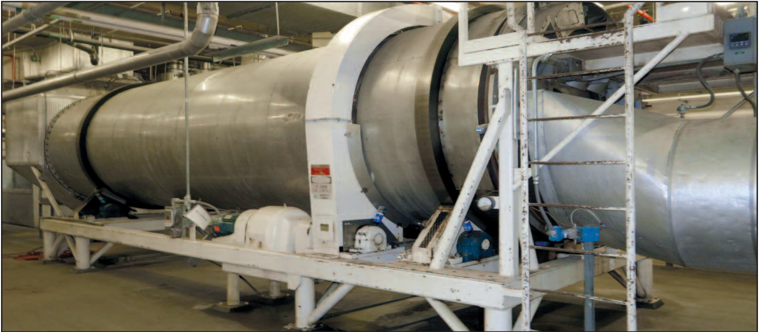
F.M.C. 7' Dia. x 30' Roto Louvre Dryer

Flex-Kleen Dust Collector on 4th & 3rd Floor Tanks; Sweco Mod. ZS40S88WC, Vibro-Energy Separator, Single Deck. S/N 566463-A0503; (Lot) Esco Magnetic Trap & (3) Rotary Air Locks; DCE Unicell Dust Collector; Great Western "HS" Sifter, Double 4' x 22"; Buhler Asperator. S/N 54860150; Mettler Toledo Mod. Lynx Digital Pallet Scale; A.B. McLaughlan S.S. Hydraulic Bin Dump. S/N 5220; S.S. Dump Bin w/Auger Discharge and Horizon Rotary Air Lock; Lot (2) Coating Reels, 36" Dia. x 78"L w/Assorted Mass Flow Sensors, Valves, Flavor Tank, etc.; (4) 30" x 30' and 56" x 26' S.S., 8" x 20' Frame Suspended Belt Conveyor; (2) Key Iso-Flo Mod. 431168-1 S.S. Vibratory Shaker Conveyor, 6" Stroke, 24" x 12' & 78" x 78". S/N 02-87430 & 02-87429; ABM S.S. Frame 28" x 16' Incline Through Conveyor; (2) Key Iso-Flo 30" x 7' x 5' S.S. Vibratory Shaker Conveyor, 6" Stroke; (3) (2002) K-Tron mod. S18028 Continuous Scales, 24" Bed. S/N MD2702012 & MD2802012; (2) Control and Metering Mod. DBW-01-350, 12" Continuous Scale. S/Ns C2735, C2734, n/a; (2) S.S. Surge Bins; AAF Type W Roto-Clone, 10hp; (3) Horizon Twin Roto-Clones w/Twin City 20hp Blower; (2) Sizing Systems w/ BF Gump Auger Feed Conveyor, Modern Process Break Roll, Bucket Elevator w/Platform; (2) S.S. Multi-Deck Vibratory Screens, 40" x 40"; (2) S.S. & Mild-Steel Bin Dumps; (Lot) Assorted Rotary Air Locks, Blowers