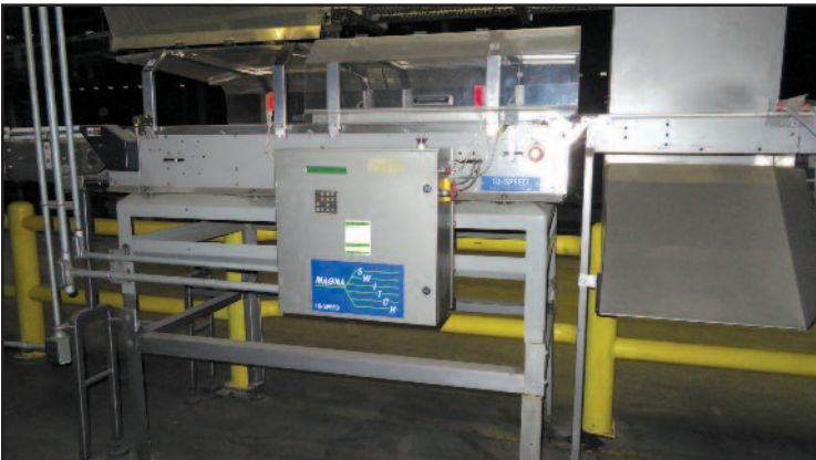
Mettler-Toledo Magna Hi-Spd Switch Check Weigher