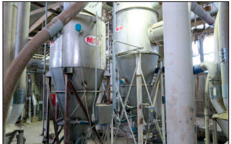
Mac Filter Dust Collector