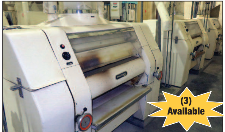
Buhler Miag Mod. 20 Flour Mills