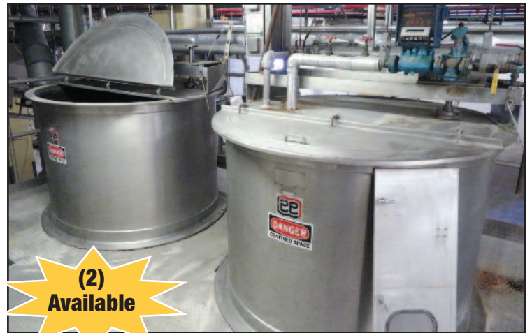
Lee S.S. Mixing Tanks

Assorted Diverter Valves, Blowers & Rotary Air Locks in Sifter Room; (3) S.S. Frame Enclosed Through Conveyor, 16" x 16', 18" x 24' Incline; Carrier Mod. BDL-N2-4150S, 24" x 18' S.S. Vibrating Conveyor, Suspended. S/N 15500; Waukesha Mod. 006 Sanitary Pump. S/N 280509-01; (Lot) Mass Flow Sensors & Assorted Valves; (2) S.S. Paddle Conveyors w/AB Controls; (2) S.S. Lump Breakers, 30hp w/AB Controls; (5) GRC Dust Collectors; (Lot) Micromotion Flow Meters, S.S. Valves, etc.