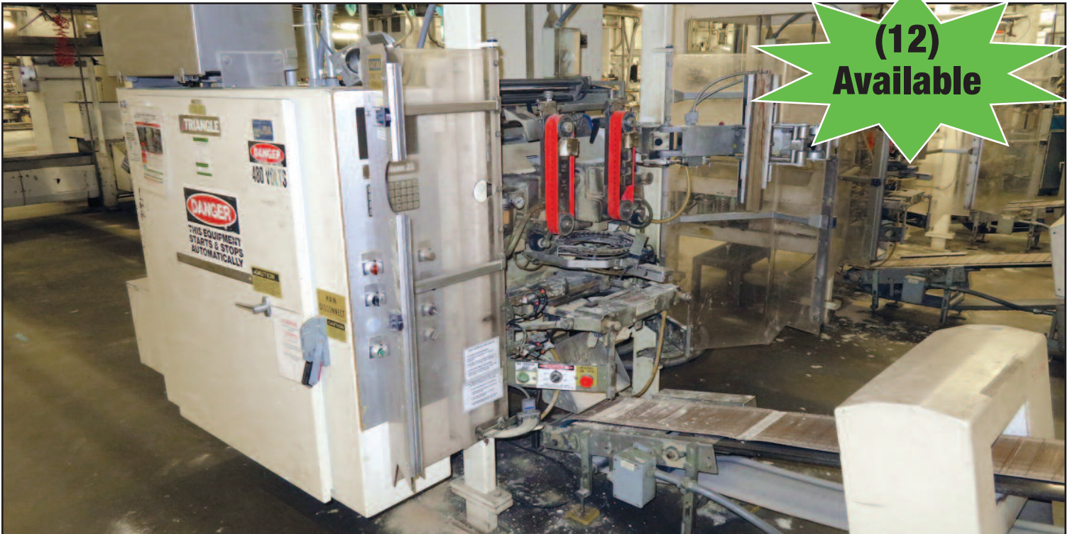
Triangle Form-Fill-Seal Packaging Machines

Line 1 Thru 4 – (4) Currie Mod. LSP-5 Case Palletizers w/Kaufman Pallet Wrapper Labeler