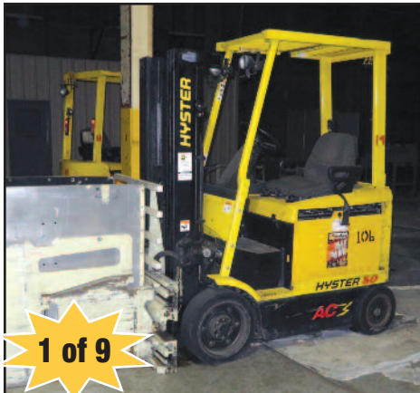
Hyster 5000lb. Electric Forklifts