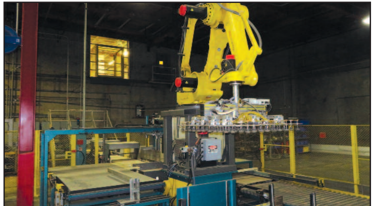
Fanuc M410i Robotic Loader