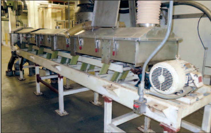
Cardwell S.S. Vibratory Conveyor, 32"x18'

DCE Sintamatic 10hp Dust Collector. Type SU40HS5AD; (2) Flex-Kleen Mod. 84-BV-16-II Dust Collectors. S/Ns 32-51-7228; (2) Horizon Vertical Filters (Silo Feed) w/Rotary Air Lock; (2) Mac S/S Pneumatic Filters w/Rotary Air Lock; (1997) Buhler Type MYFB Flour Return System w/14" Da. x 7' Screw Conveyor. S/N 530519; (5) S.S. Blended Flour Bins, Double Screw Type, Bottom Discharge w/Top Mount Buhler-Miag Dust Collector; Dust Collector Parts Room w/Bags & Filters; Schuler S.S. Syrup & Flour Blend Bin w/Single Screw Discharge; (2) S.S. 10" x 20' Incline Auger Feed Conveyors; Safeline Mod. 333 V2, S.S. Flow-Through Metal Detector. S/N 17179; Assorted 10" S.S. Auger Conveyor; (2011) Waukesha Mod. 018U1 SPX Sanitary Pump. S/N 10000022720779; (4) Assorted Buhler Rotary Air Locks; 10" x 16' S.S. Auger Conveyor; S.S. Overhead Belt Conveyor, 24"W x 75'; (2) Ametek Mod. DR909BE72W Blowers