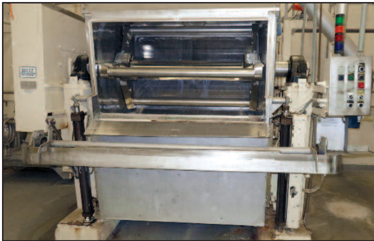
Baker Perkins 2000lb Roller Bar Dough Mixer