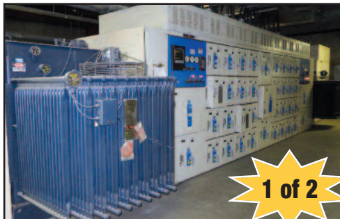
G.E. 2500 KVA Substation Transformers