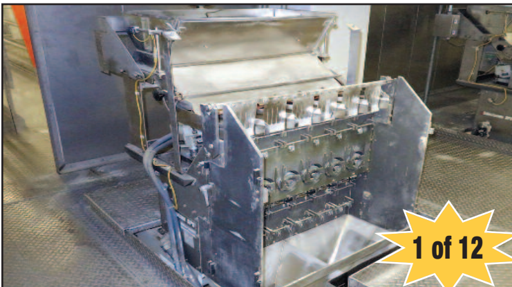
Ishida Selectacon 6-Head & Flexitron Weight Scale Feeders