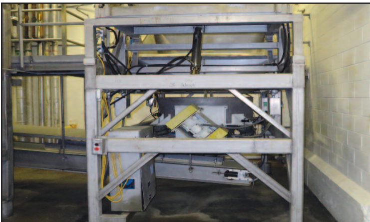
S.S. Bin Dumpers (First Line)