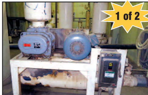
Sutorbilt GDGBRAA, 50hp Vacuum Loaders