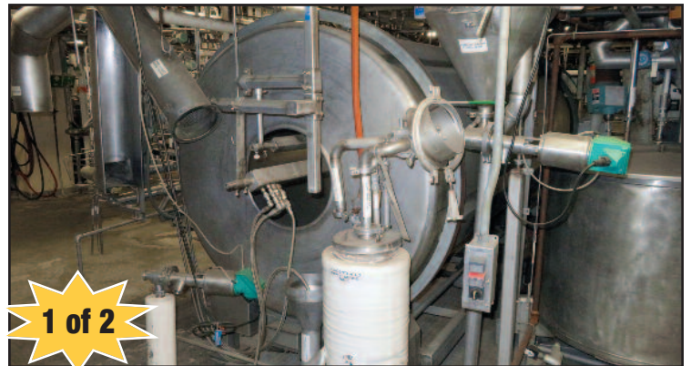
(2) Coating Reels, 3' x 6'