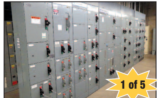
Allen Bradley Centerline 2100 M.C.C.

ONLINE AUCTION ONLY – Lot #1 Starts Closing Tuesday, May 16, 10:00am PDT