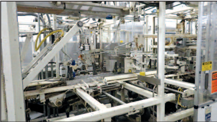
Sure Way 90F Servo Case Erector & Closer