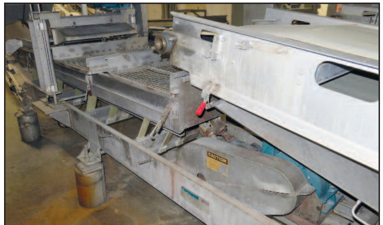
Cardwell 2'x10' S.S. Lump Breaker

Check out our upcoming auction calendar at www.tauberaronsinc.com