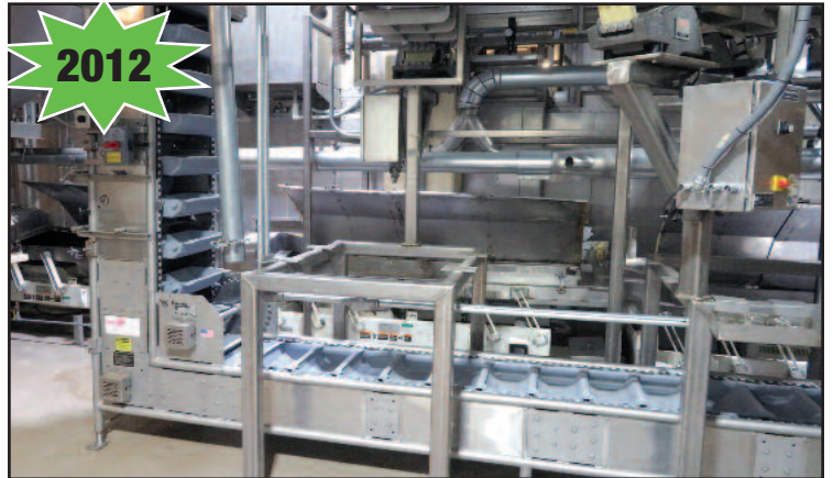
Deamco Tubular X, Bucket Elevator