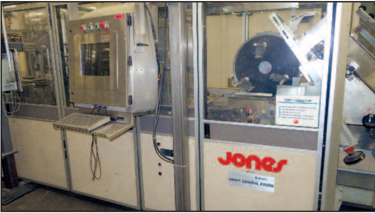
Jones Orbi-Track BFC Former