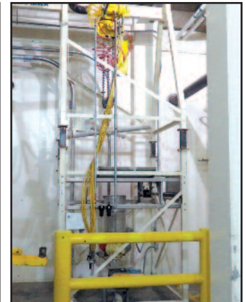
Super Sack Bag Dumper