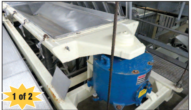
Rotex Mod. 311, 3'x14' Flat Bed Sifters