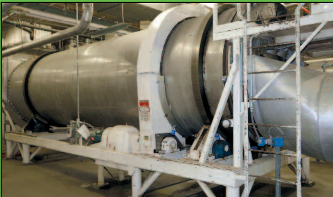
F.M.C. 7' Dia. x 30' Roto Louvre Dryer

Lot #1 Starts Closing Tuesday, May 16, 10:00am PDT 901 E. Whitmore Avenue, Modesto, CA 95358