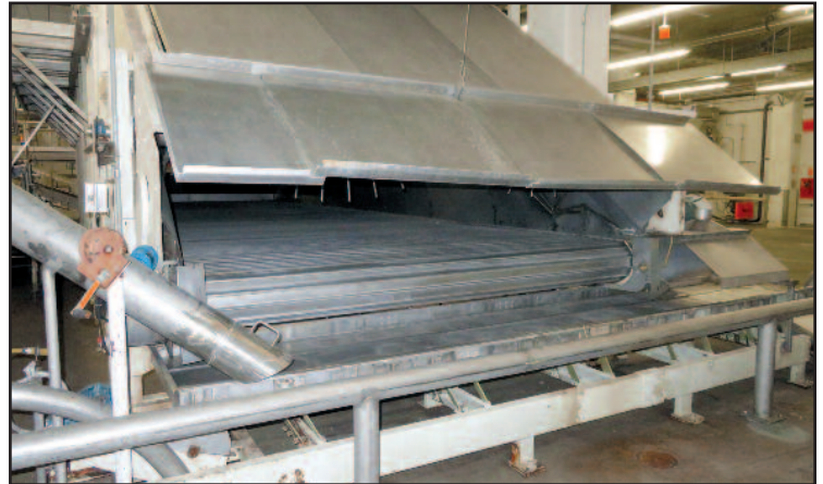
10' x 30' S.S. Finish Bin Holding Silo