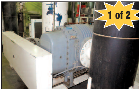
Tuthill 75hp Vacuum Loaders