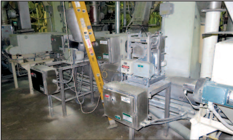
Bran Line w/K-Tron Weigh Scales

Flake S.S. Chute w/Safeline Inline Metal Detector, Feeding to Packaging; Waste Offload to Slurry Pumping Station; S.S. 'V' Blender (Approx. 20 C.F.); Forberg 3' x 3' Coconut Hammer Mill