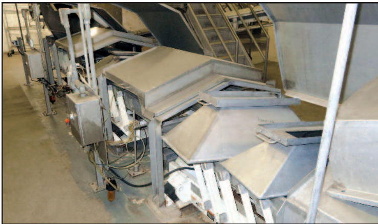
Link Belt 2'x6' Vibratory Feeder

(24) Sylvania Clark M.C.C. Section (Throughout Plant)