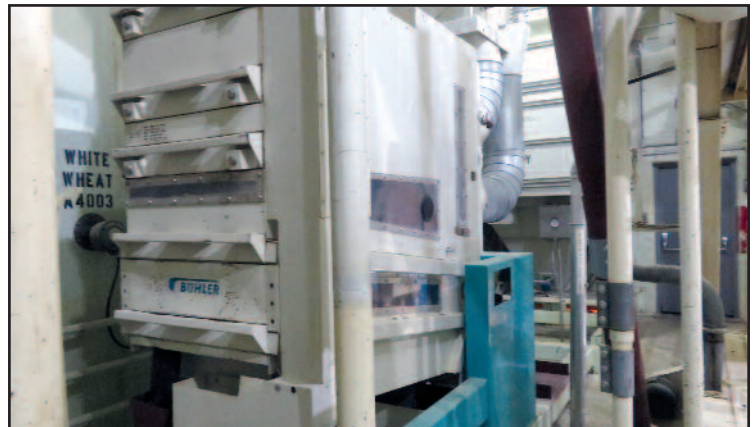
Buhler MTKB65/1200 Wheat Cleaner

Join our mailing list, email us at main@tauberaronsinc.com