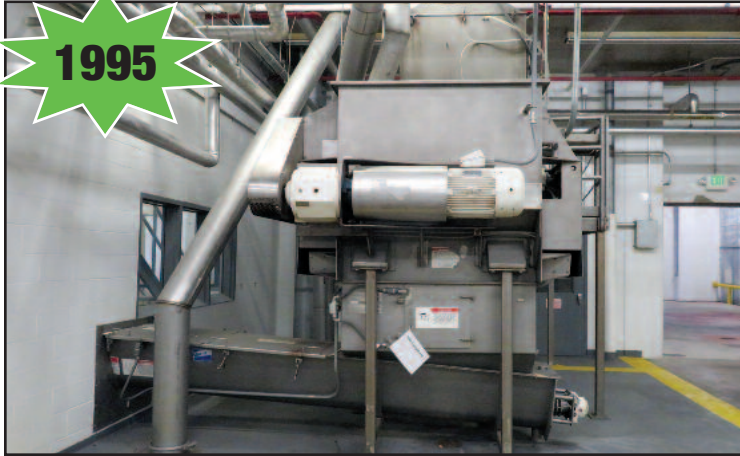
American Process System Mod. HS30 S.S. Dry Coating Mixer

(2006) Buhler Mod. MEAF and MZAH 12 Auger Blender System. S/N 156523/7