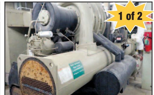
Trane Central Vac Turbo Chillers