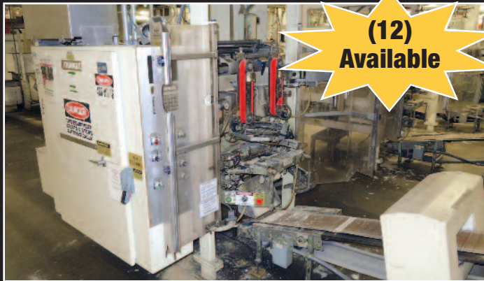
Triangle Form-Fill-Seal Packaging Machines