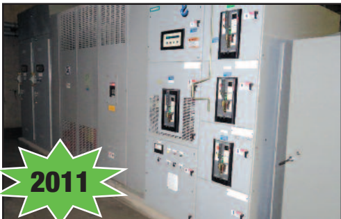
Siemens-Virginia 12.47 K.V. Transformer