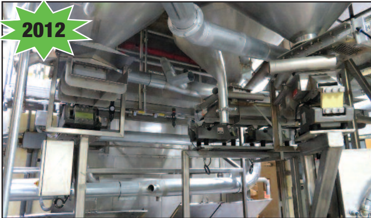
Eriez Mag. Weight Scale Feeder System