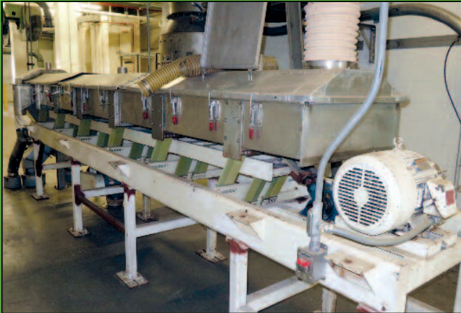
Cardwell S.S. Vibratory Conveyor, 32"x18'

Lot #1 Starts Closing Tuesday, May 16, 10:00am PDT