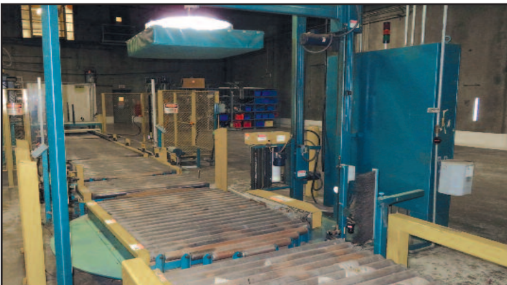
Kaufman Pallet Wrapper